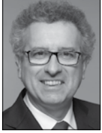
Pierre Gramegna Minister of Finance of the Grand-Duchy of Luxembourg

Pierre Gramegna was born on 22 April, 1958. He is married and has two children.